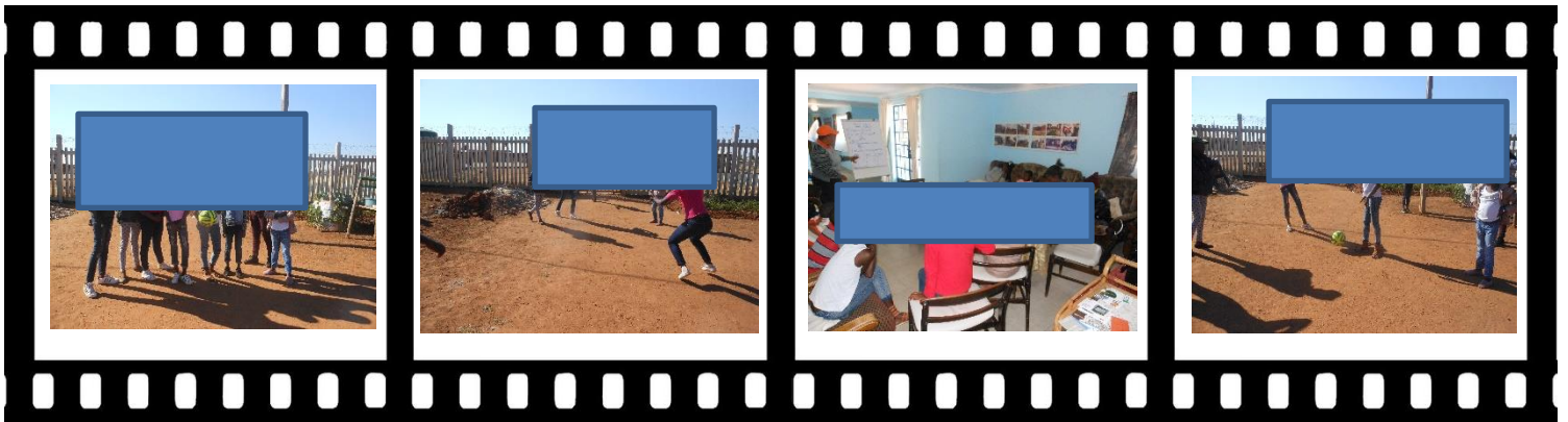
Children's support group at Nakekela