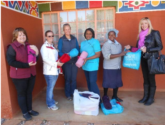
Grade 7 learners donated warm blankets to patients