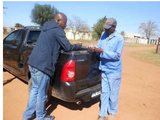
Vegetable garden seeds donation from the Department of Agriculture