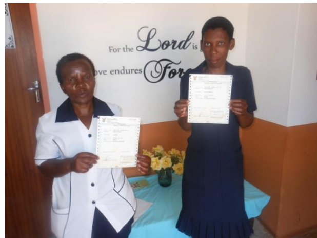
So proud of our Home Based Care Workers who worked so hard to help two field patients to get birth certificates