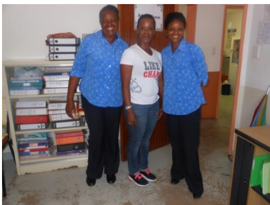
We were blessed to have Neo at the centre to encourage our in patients to trust in God and continue taking their treatment even at home.