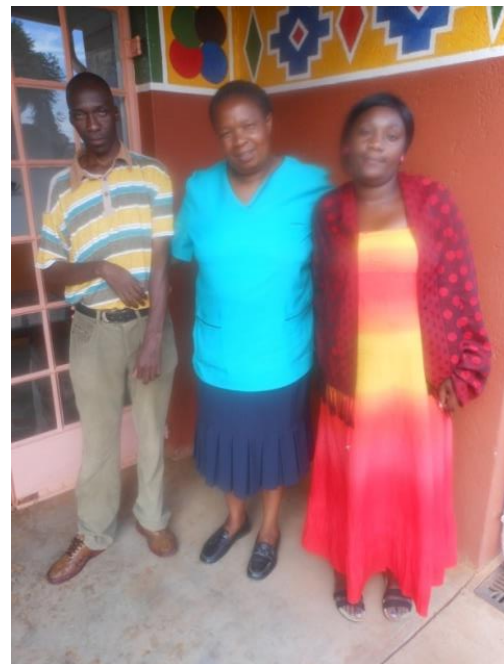
The two ex-patients who got married in December 2014

We thank our Donors who were touched by God to help us to run our Centre and we praise God for them.