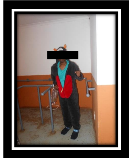
Above is the picture of a patient at the centre doing some exercises

We gave our best to have his condition improved, cleaning wounds, administering medication, mobilizing him with physiotherapy and ongoing spiritual/Biblical Counseling. He stayed in our care for 6 months, and changed from a shrunken wreck to a new creation in Christ Jesus. When he left to go home all cried from joy, as he walked out on crutches with the grace of God in his heart.