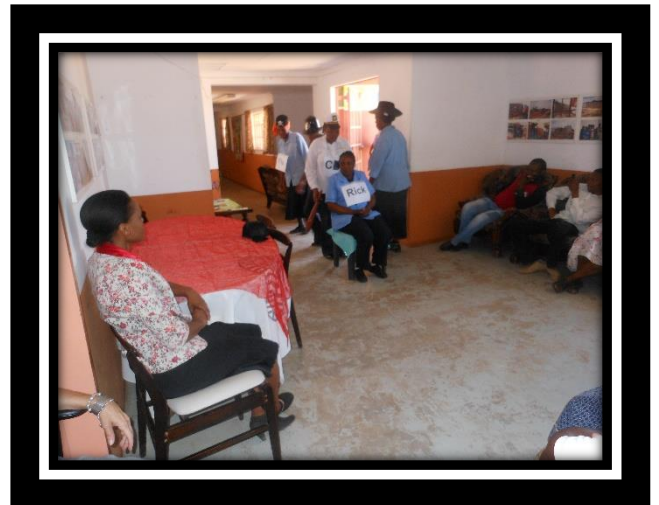
Some staff members performing the HIV drama during CABSA's Training for Pastors

It is our pray that people might find God as their refuge and strength and they might see the church as a place they can go to obtain mercy from God regardless of their HIV/AIDS Status.