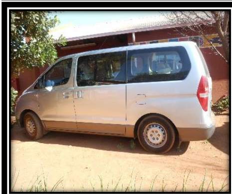
Photo's of the New Car