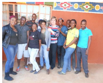
Evaluations at Nakekela