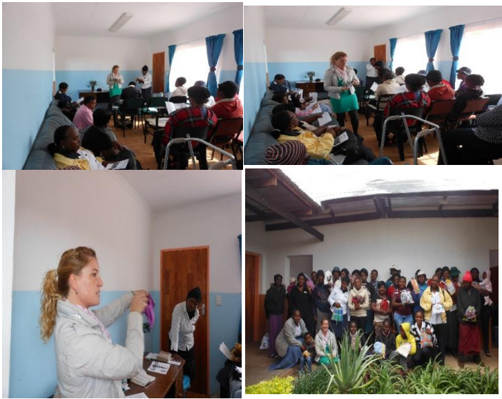
Photos of the fearfully and wonderfully made feminine hygiene workshop