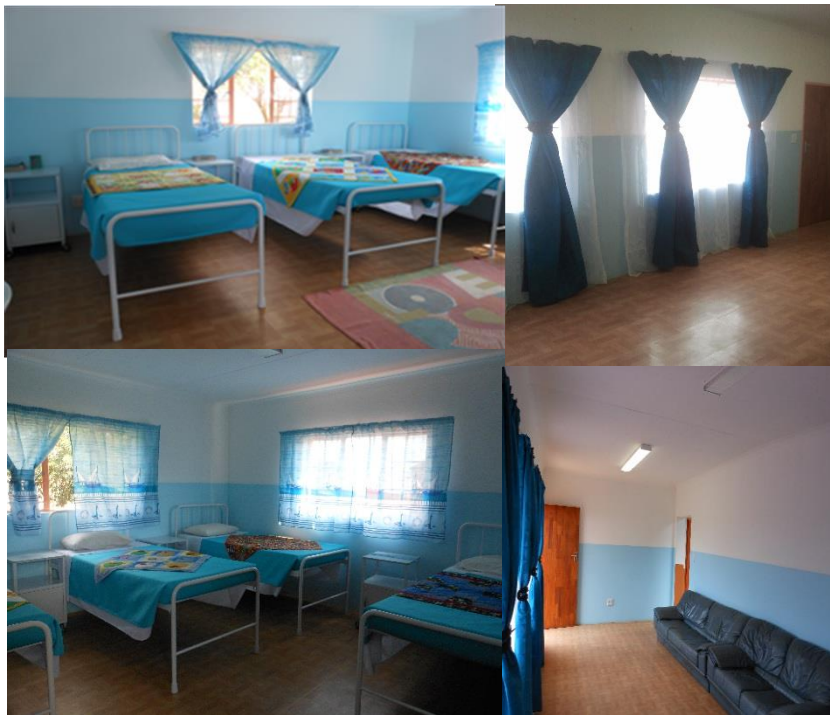
Photos of our new wards, recreation room with our new Television.