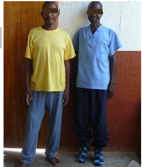
The two friends shortly before they were able to go home

ceived he was able to return home in April with the knowledge of how to take his medication, and the ability to walk. When we were bringing him home, he was greeted by his family and neighbours. They were so pleased to see him return home healthy and able to do things for himself once again.