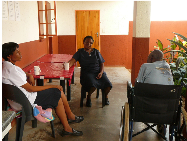
Care workers chatting with a patients while on break

Vision: To work in collaboration with local communities including churches, schools government structures and other community institutions and stakeholders to further its main objective (as stated in the mission)