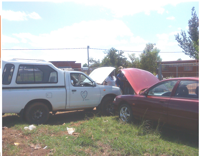
The Nakekela 'bakkie' receiving a boost from a local man after finding the battery flat