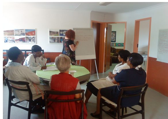
A Strategic Planning session for 2011 with some staff members