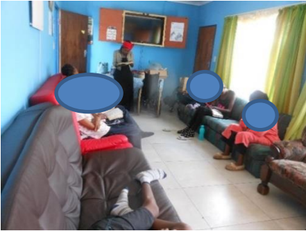
Devotions with patients and Care Workers