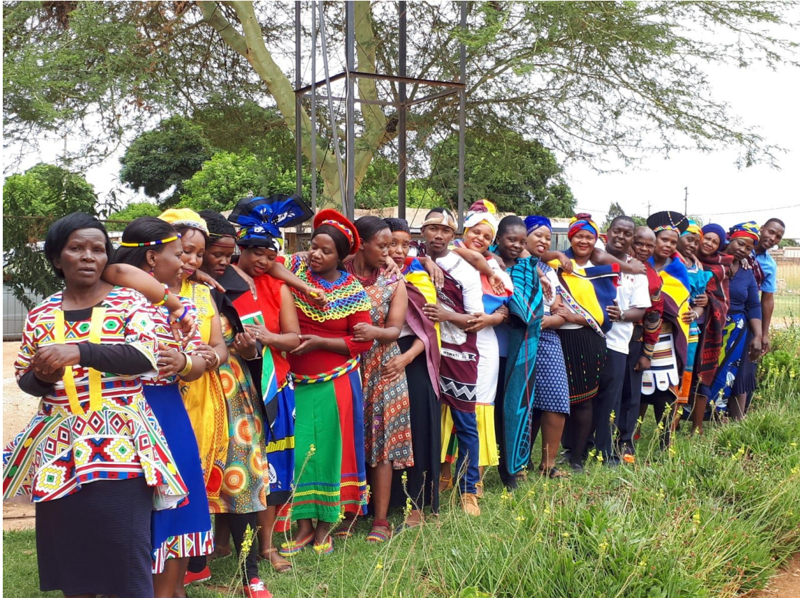
Above: Nakekela Staff members

Greetings in the Name of our Lord Jesus Christ from everyone at Nakekela!