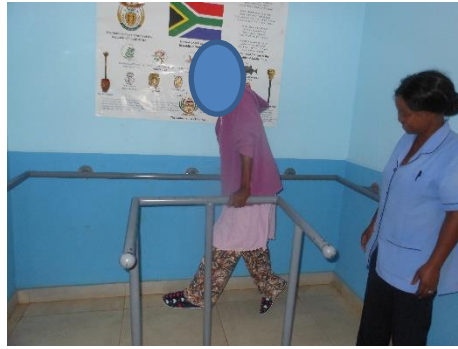
Patients continue to do body exercise and physiotherapy under supervision of Care Workers.