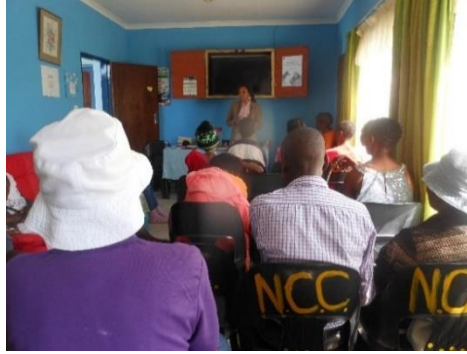
Adult Support Group

“Be strong and courageous! Do not be afraid or discouraged. For the Lord your God is with you wherever you go” Joshua 1:9